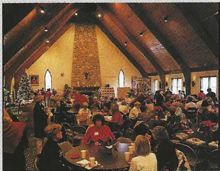
Roundtable groups at the monthly General Meeting

quilt related publications. Recently they participated in a challenge requested by a major fabric company. These quilts were exhibited at the Quilt Market in Houston and will be shown worldwide during 1993.